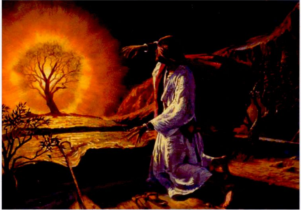
Moses approaches the burning bush in Sinai.

This was the wilderness of Sinai, far from the Promised Land to the north. For Moses, this was a land of exile. How could