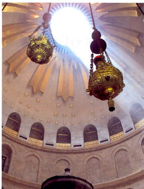
Dome of the Church of the Holy Sepulchre

place? Ancient oil lamps hanging from smoke-darkened ceilings, worn stone floors from the feet of millions of pilgrims, cold walls and pillars looming high around you. But these walls enshrine the holy ground where God himself gave his life for our sins and rose from the dead to conquer death and open the heavenly doors to eternal life. This is not just good history and theology—this is cosmic grandeur and heady truth that would embarrass the best science fiction writer. Remember, fact is often stranger than fiction.